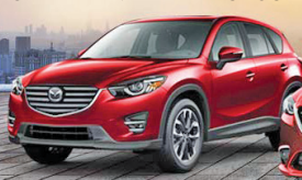
2016.5 MAZDA CX-5